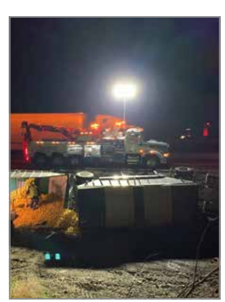
Night Scan® HDT Heavy-Duty Towing Light Tower