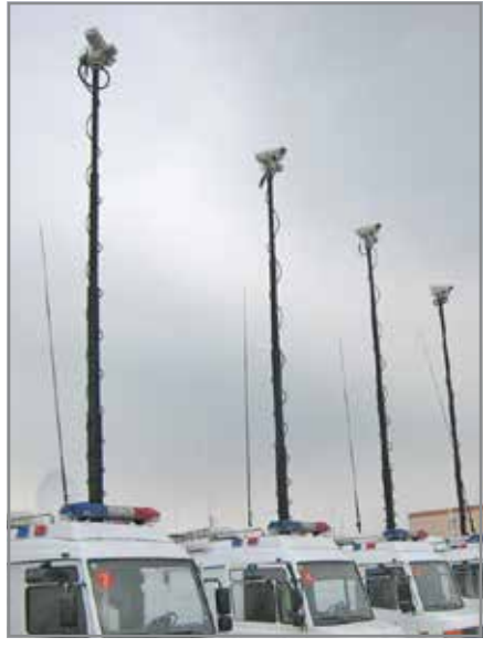
GEROH KVL Robust, Crank Mast