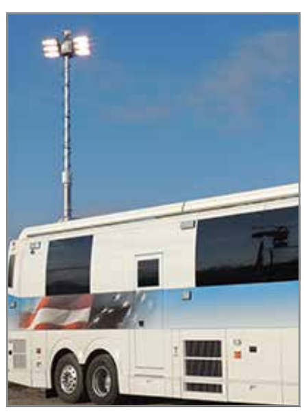
Night Scan® Command Center Application