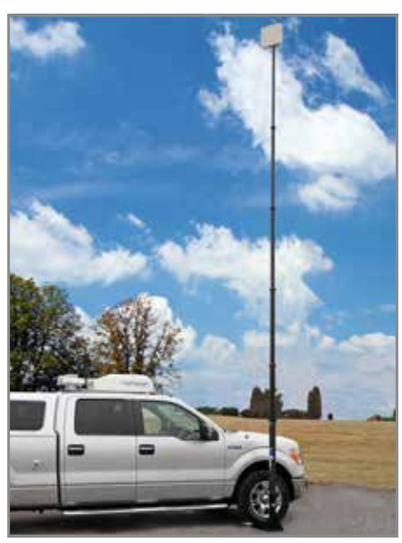
Hurry Up Portable, Push Up Mast