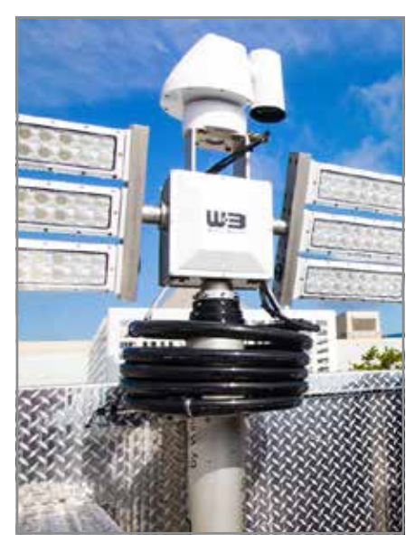
Night Scan® Light Tower with Camera